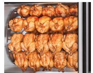
Large product view