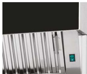
Ventless hood (optional)